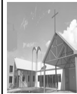
St. John the Baptist

Through towns and villages Jesus went teaching, making his way to Jerusalem. Someone said to him, 'Sir, will there be only a few saved?' He said to them, 'Try your best to enter by the narrow door, because, I tell you, many will try to enter and will not succeed. 'Once the master of the house has got up and locked the door, you may find yourself knocking on the door, saying, "Lord, open to us" but he will answer, "I do not know where you come from." Then you will find yourself saying, "We once ate and drank in your company; you taught in our streets" but he will reply, "I do not know where you come from. Away from me, all you wicked men!" 'Then there will be weeping and grinding of teeth, when you see Abraham and Isaac and Jacob and all the prophets in the kingdom of God, and yourselves turned outside. And men from east and west, from north and south, will come to take their places at the feast in the kingdom of God. 'Yes, there are those now last who will be first, and those now first who will be last.'